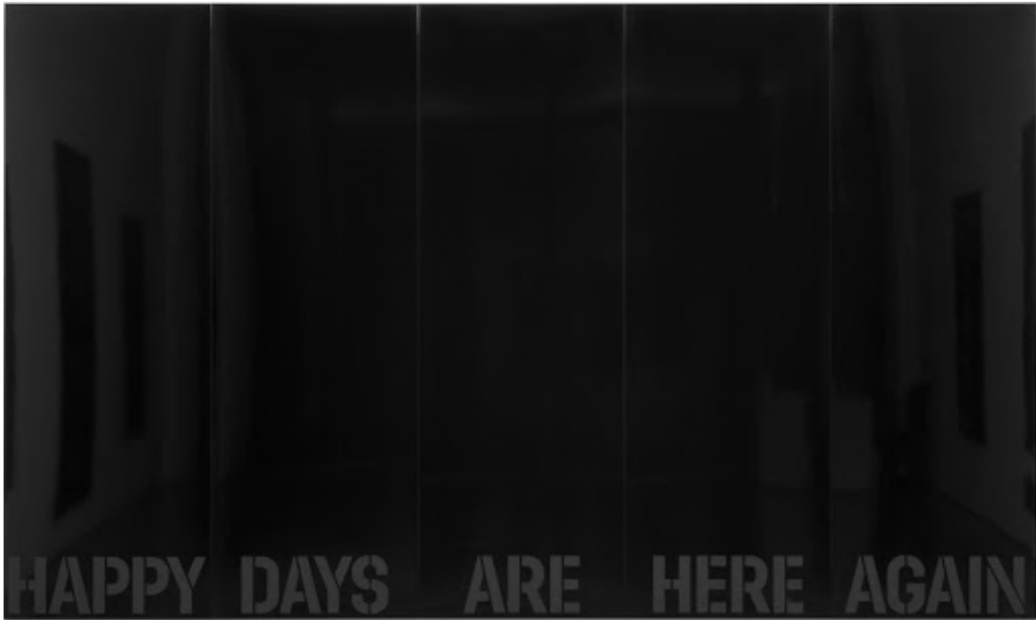
Happy Days , 2013. Oil and automotive urethane paint on canvas, 72 x 120 inches.