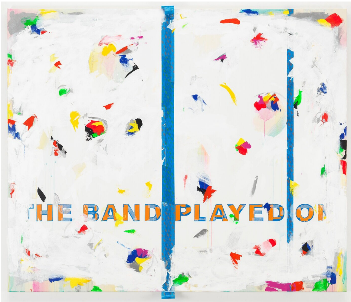
The Band Played On #1 , 2014. Acrylic and tape on canvas, 70 x 59 inches.