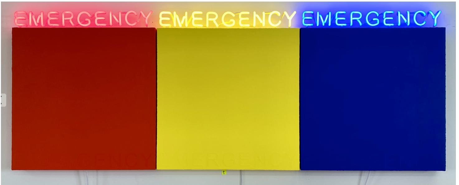
Emergency , 2019. Acrylic and neon on canvas.