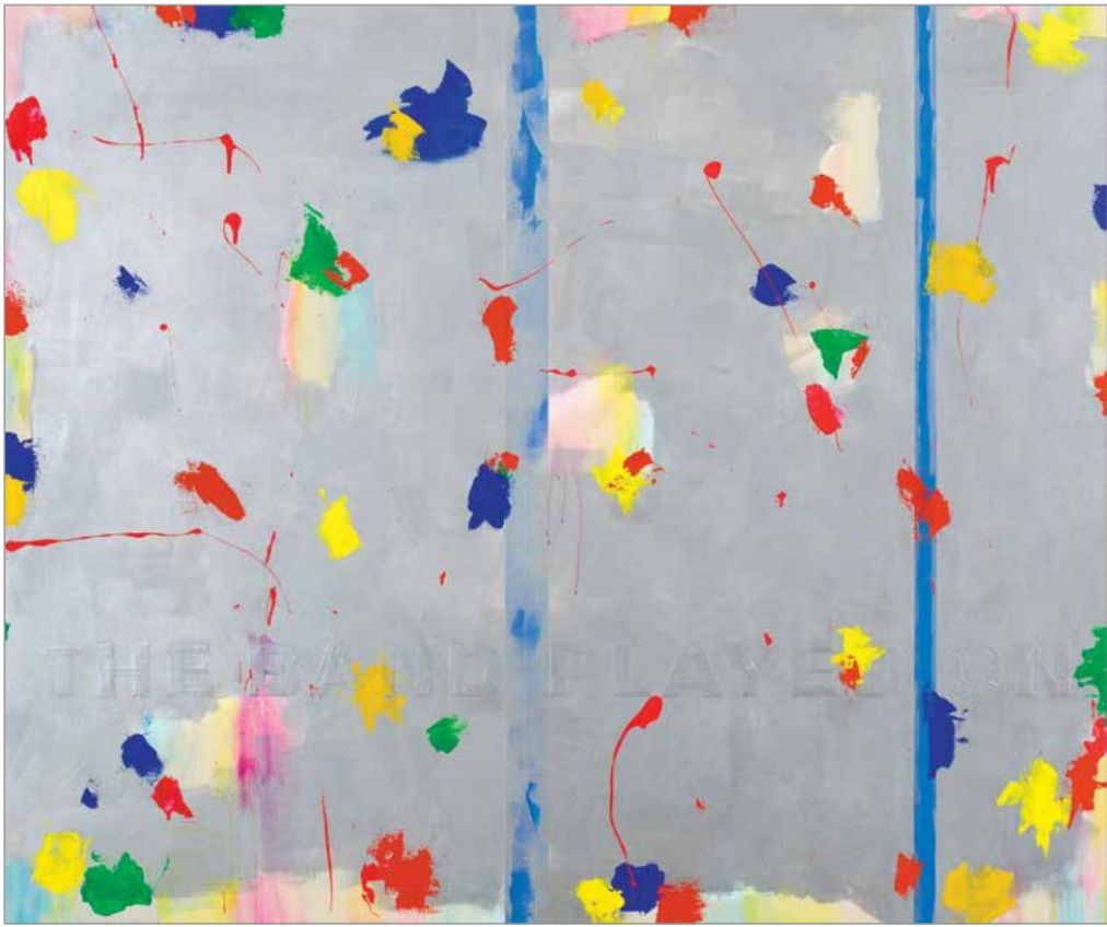
The Band Played On #2 , 2014. Acrylic and tape on canvas, 60 x 72 inches.